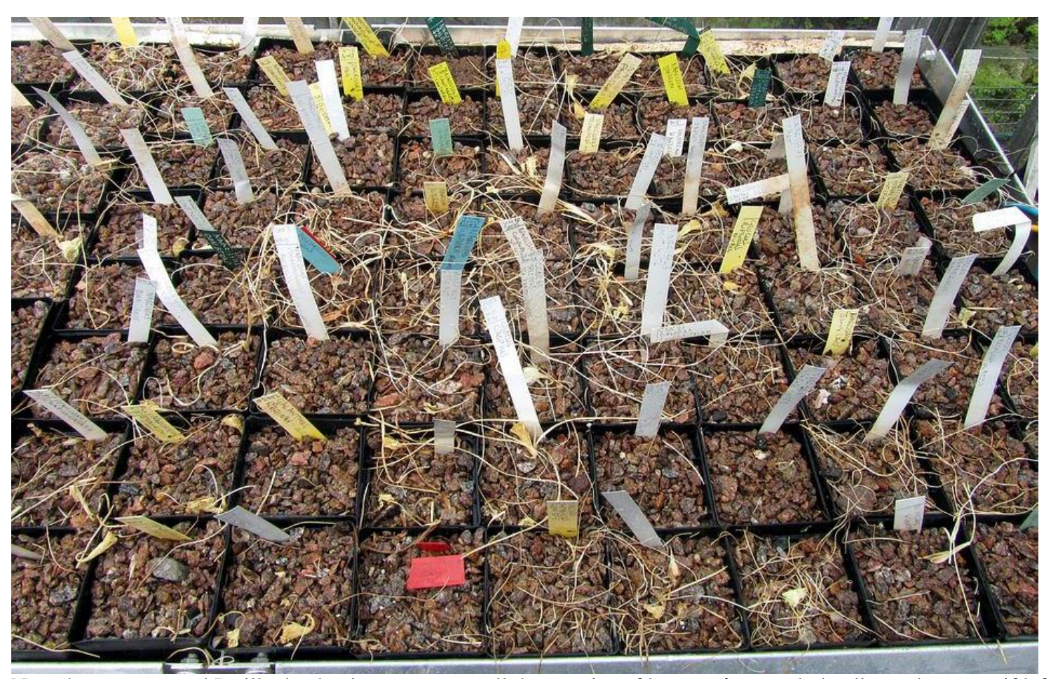
Now they are watered I will take the time to remove all the remains of last year's growth that litters the pots – if left the dried leaves, stems and flowers will become infected with rots and moulds especially when the weather turns cold and wet - these can in turn spread to the emerging new season's growth.