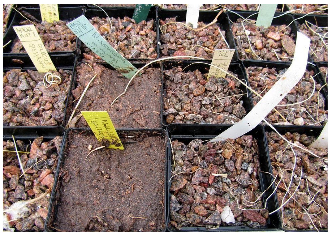
Here two pots which were repotted this year and did not get a gravel top dressing. You can see how the first flood has caused the lighter more organic components of the potting mix to float to the surface showing how a flood of water can reorganise the different components of the mix.

The two pots that are still holding on to the water were both repotted this year while all the surrounding ones that were not repotted this year have drained away already. This shows how even with in a small pot a soil structure forms within the potting medium – those pots that were not disturbed have a good structure with established drainage pathways allowing the water to drain away very quickly. It takes a few good soakings before those pots that were replanted this year will establish such an efficient drainage nonetheless they should still drain away in a reasonably short time of around one minute.