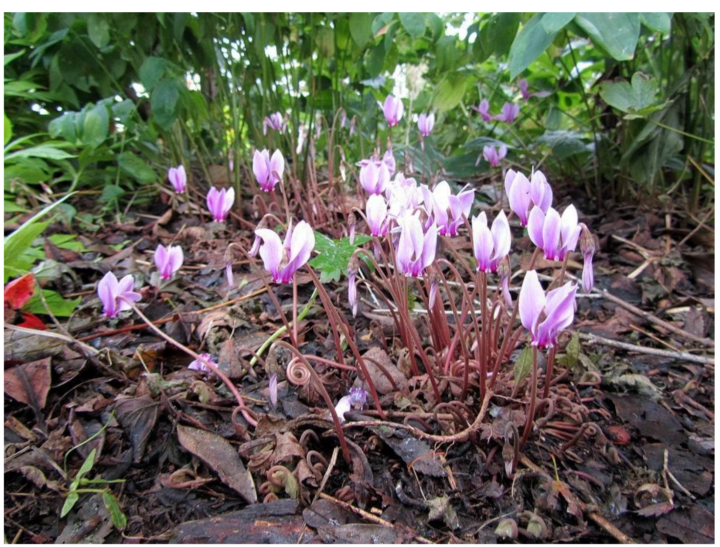
So much more work to do in the garden so I will leave you with another Cyclamen hederifolium ......