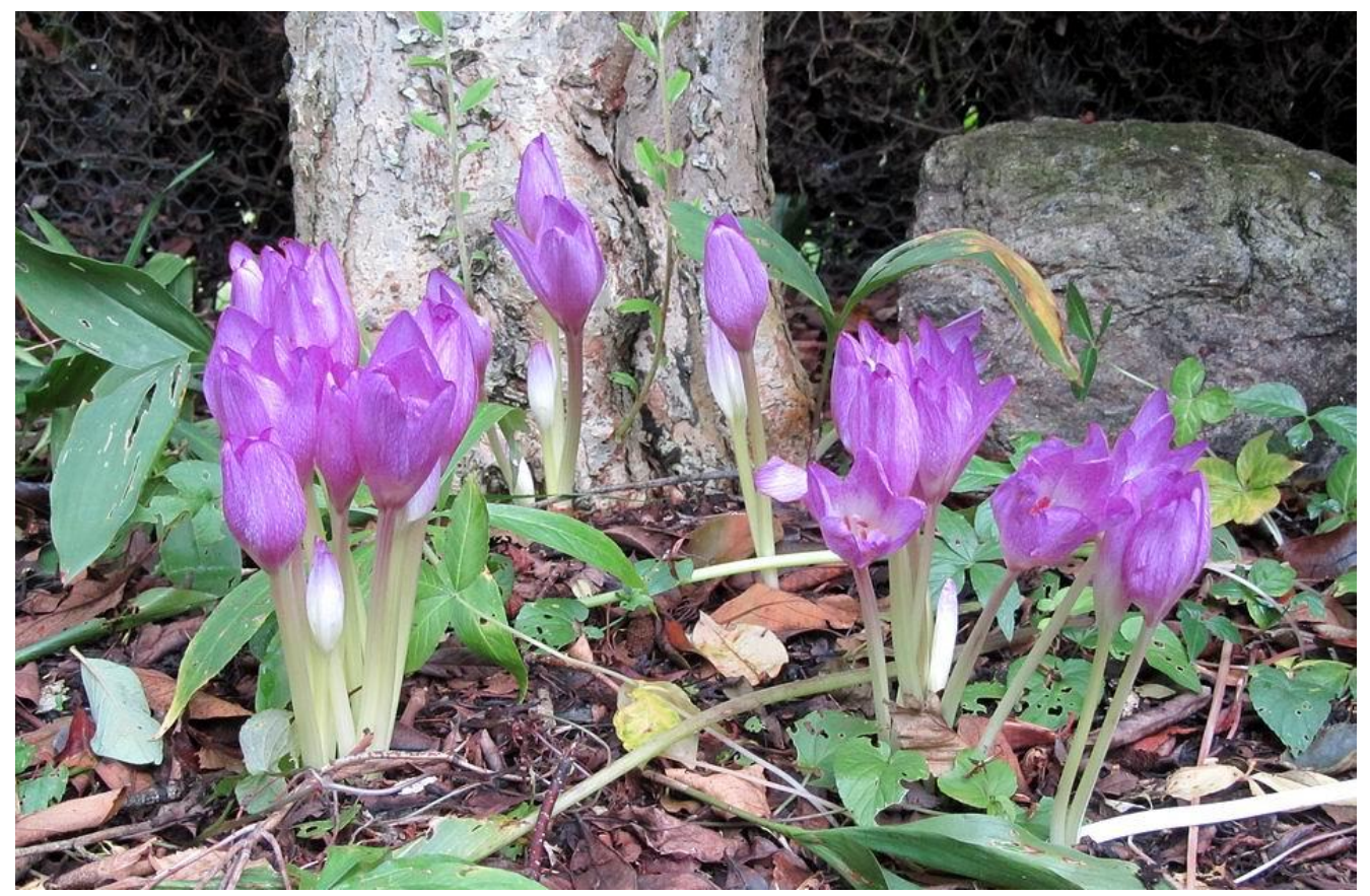
The large colchicums are starting to bloom in the garden attracting many hoverflies