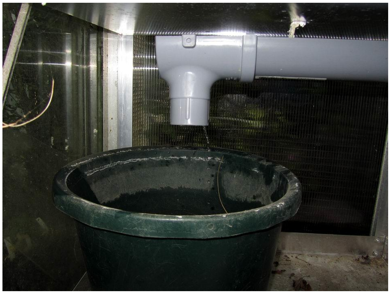
The drainage system that I have under my new staging allows me to collect and recycle all the water that drains away including any soluble nutrients so nothing is wasted.