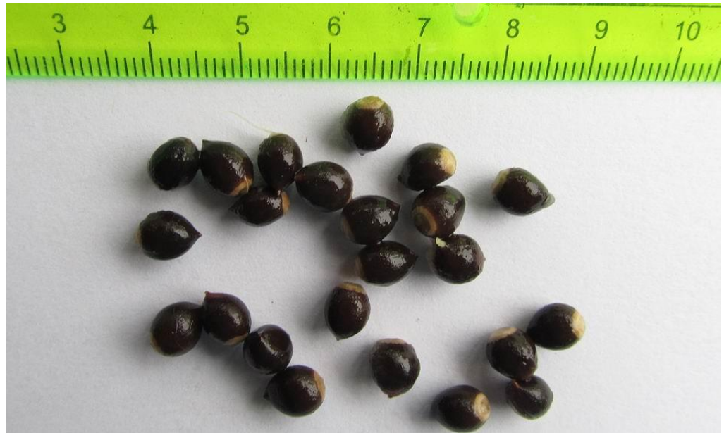
I removed exposing the shiny black seeds – which I photographed.