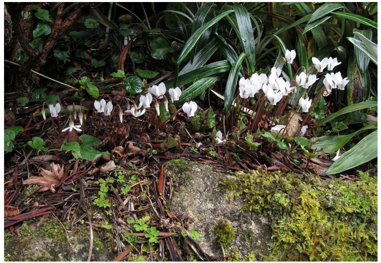
Cyclamen hederifolium are flowering all around the garden; the white forms seem to grow particularly well.