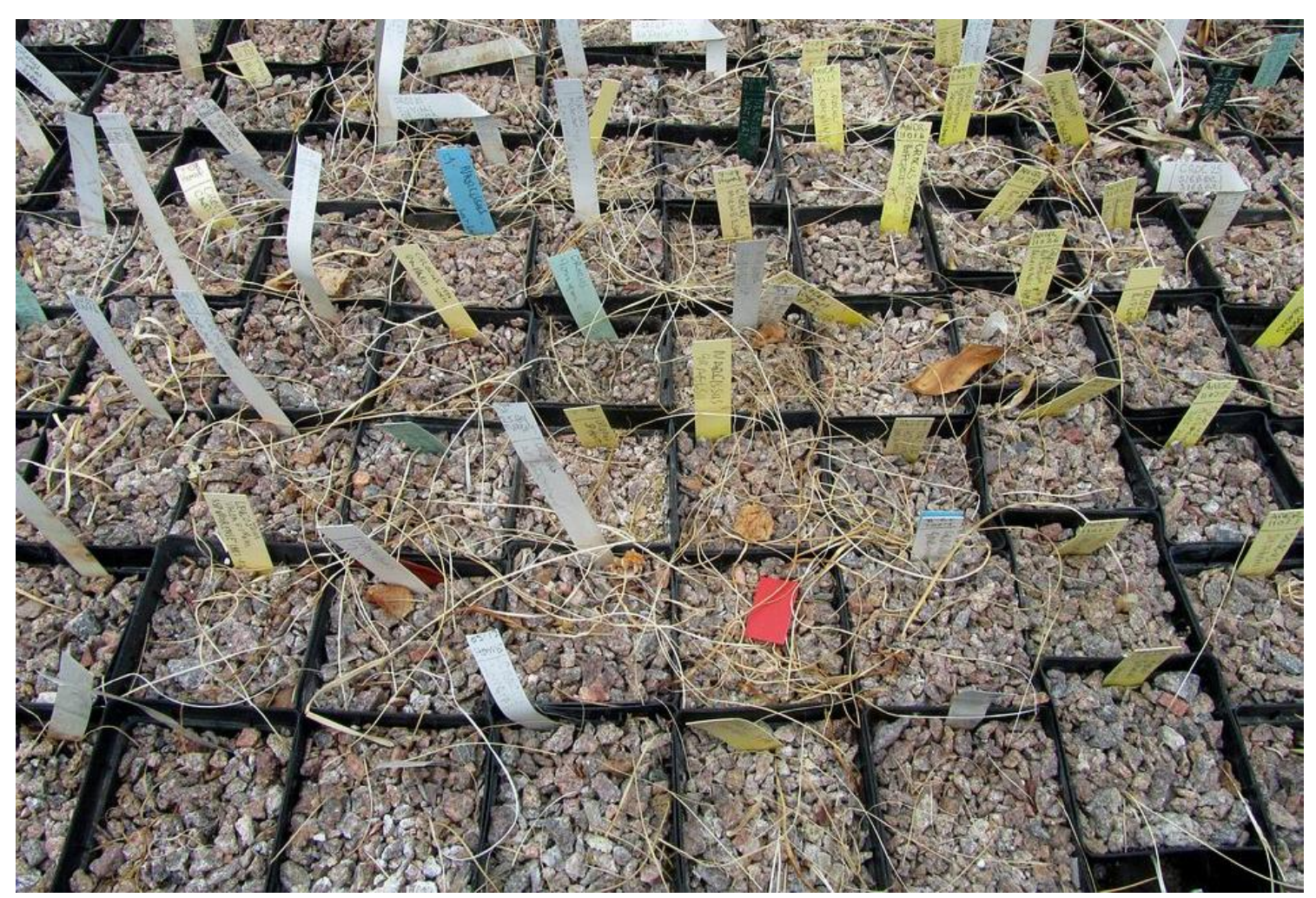
7 centimetre pots