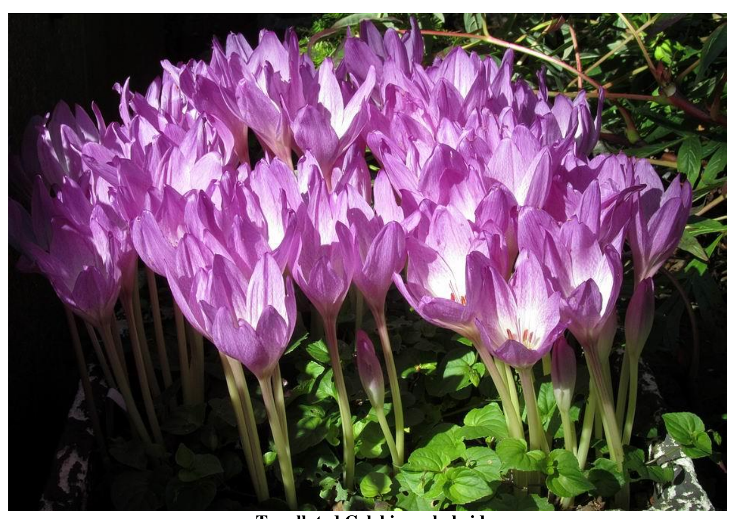
Tessellated Colchicum hybrid