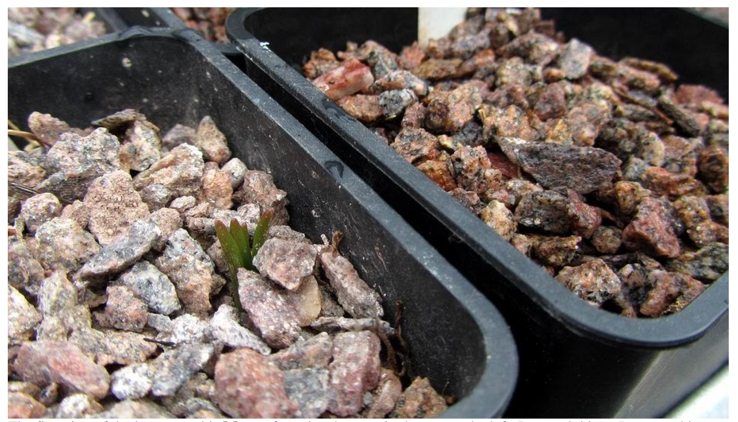
The first sign of the leaves on this Muscari can just be seen in the pot on the left, I spotted this as I was working around watering the pots and it is another sure sign that I have my timing correct and am starting to water at the best time in our area. If you live in warmer areas the first watering may be best left for a while yet.