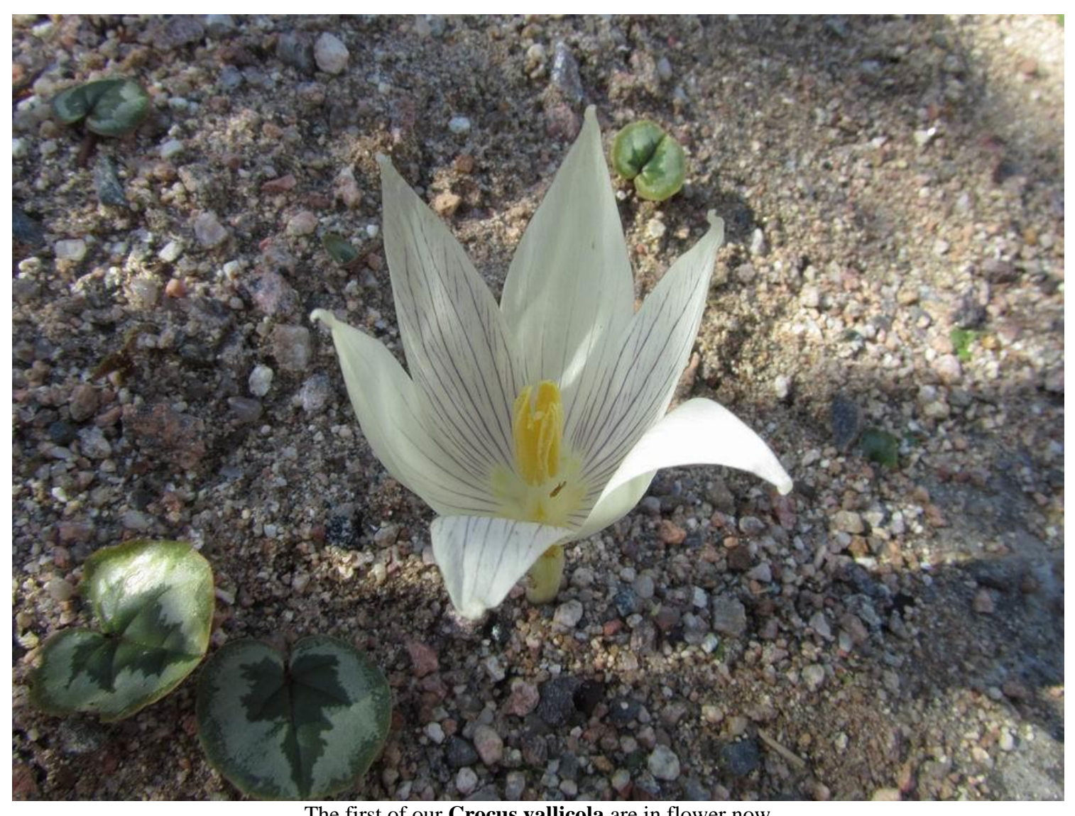
The first of our Crocus vallicola are in flower now.